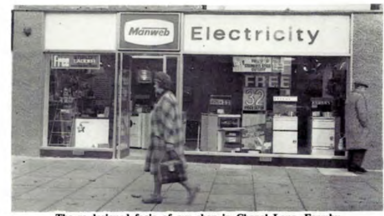
The re-designed facia of our shop in Chapel Lane, Formby.

For eleven weeks, staff at our Formby Shop put up with the cramped conditions working from the Showmobile which was parked right outside their shop which was being re-designed. Business was maintained at the beginning but as the weeks went by, sales began to fall. Now that the Shop has re-opened business is booming again and future prospects look very bright.