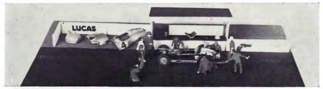
An all-action scene with a model car and model mechanics—all to exact scale—as they go to work in the pits. The picture even includes a figure in the exact likeness of BBC commentator, John Boulter.

is for appearance, construction, scale detail and finish.